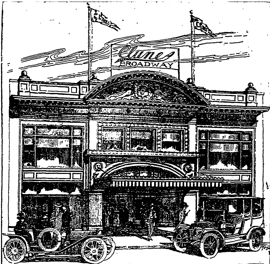
CLUNES · BROADWAY · THEATRE

The auditorium will be 57x100 feet in size and thirty feet high, with beams and paneled ceilings and a large skylight over the center. The seating capacity will be 900. The ventilation and heating facilities will be perfect. The proscenium opening, which will be 21x28 feet in dimensions, will permit the exhibition of pictures much larger